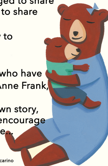
Illustration by Dan Yaccarino